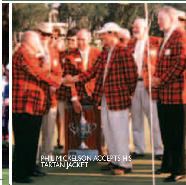
PHIL MICKELSON ACCEPTS HIS TARTAN JACKET