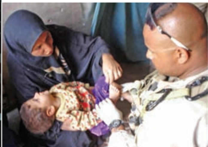
Left: A Marine comforts an Iraqi mother while providing her child with medical care. Left below: A young Iraqi boy lights up at the sight of his new soccer ball.