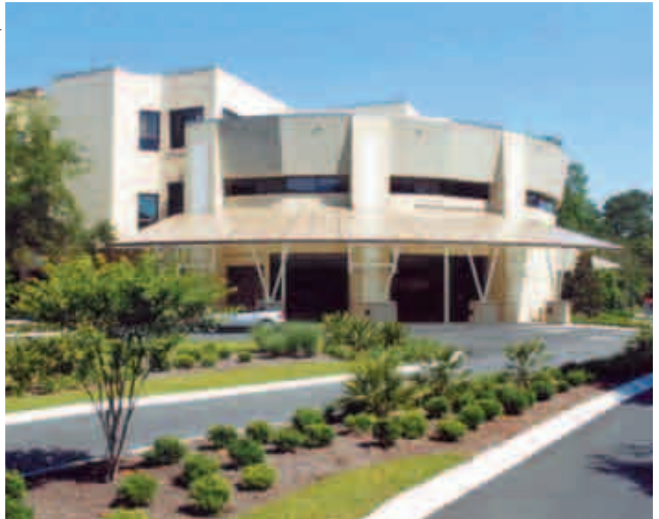
Above: Hilton Head Regional Medical Center.